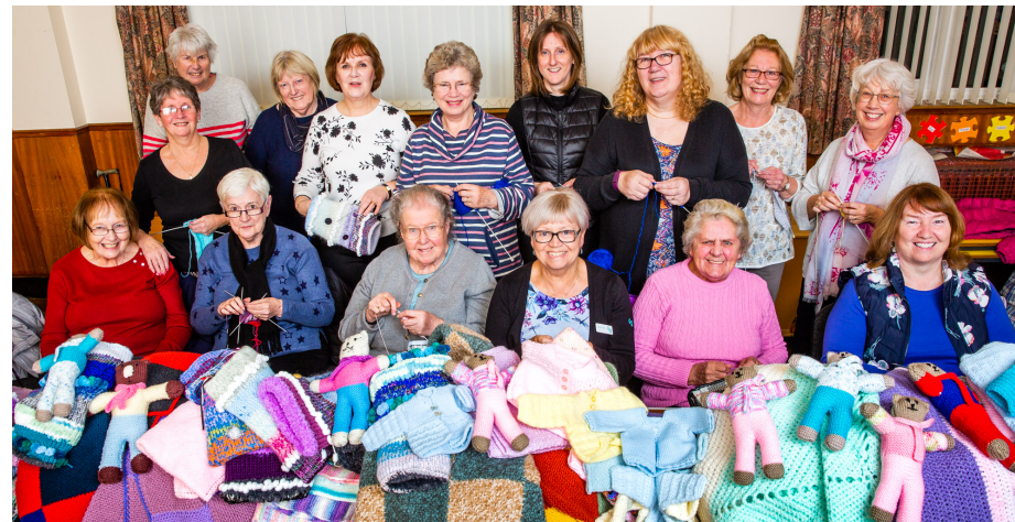
THE LADIES OF THE K2 KNITTING GROUP WITH JUST SOME OF THE THINGS THEY MAKE

As you can see we keep very busy and get a lot of satisfaction out of helping others while enjoying the fellowship our group brings.